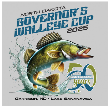
Full front design.

Pre-orders will be available for pick-up at the Garrison Auditorium, Thursday, July 17 after 4:30 p.m.